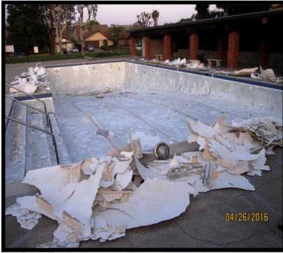
Fiber Glass being Removed