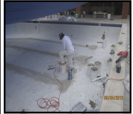
Days of Sanding & Fiberglassing