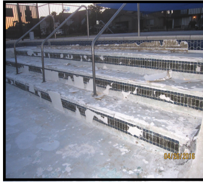
Stripping of the Steps